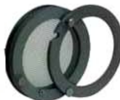
4" (102 mm) Model with Lucite Cover