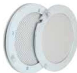
6" (152 mm) Model with Metal Cover