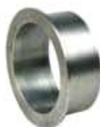
TAR134 for 1-3/4" (44 mm) Doors

Optional Thickness Adapter Rings are available for the 4" (102 mm) Speak-Thru. One for 1/2" (12 mm) glass; one for 1-3/4" (44 mm) doors.