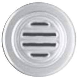
834 Series Aluminum Construction