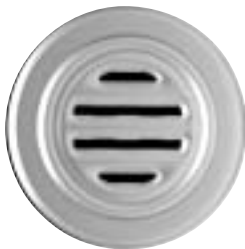
549 Series Chrome Plated Brass