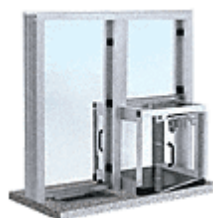
Bullet Resistant Combination Clear Vision Pass