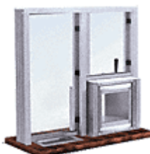
Bullet Resistant Combination Rotary Server Pas