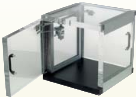
Left Hand Model (Customer's Side)