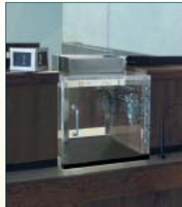
Right Hand Model (Customer's Side)

The Clear Package Receiver is designed for interior use only. Satin finish aluminum extrusions are used to fasten the sides and bottom together. Bottom is constructed of plywood and bullet resistant fiberglass covered with plastic laminate. A special interlocking mechanism allows only one door to open at a time. Closer furnished on customer side door. Contents can be clearly viewed from the top and all four sides. Handing is determined by hinge placement on customer's side. Inside Dimensions: 13-5/16" wide x 12-1/2" deep x 13-3/8" high.