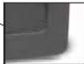
Sealed Edge Trim to Protect Mirror